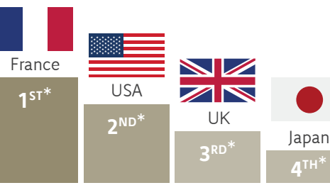
*market by value and by volume